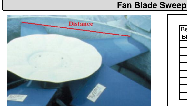
Measure From trailing edge to trailing edge of the next blade. All sweep measurements must be within 1" of each other.