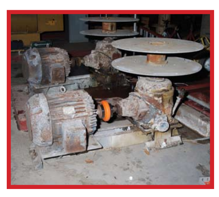
Typical motor, shaft and gearbox fan drive.

"I have always wanted to get rid of these gearboxes and all of the other moving parts," says Applegate. "Misalignment, excessive vibration and noise are all inherent problems with this system. With the high speeds, the gearboxes generate too much heat and the seals and bearings can have very short lives. There are just too many things that can go wrong."