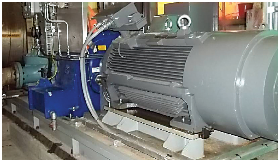
To the left is the old steam turbine coupled to the pump. The picture above shows the after picture, with the electric motor direct coupled via disc couplings to the Voith Turbo variable speed drive which is directly coupled with another spacer disc coupling to the pump.